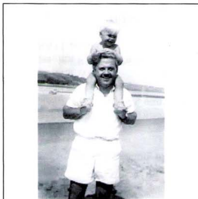
My father and Me - fy arwr/my hero

Fundraising target: £1,500.00 Donations to date: £ 700.00